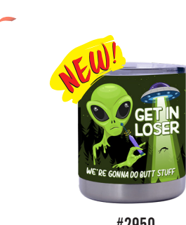
#2950 Get in Loser We're Gonna do Butt Stuff