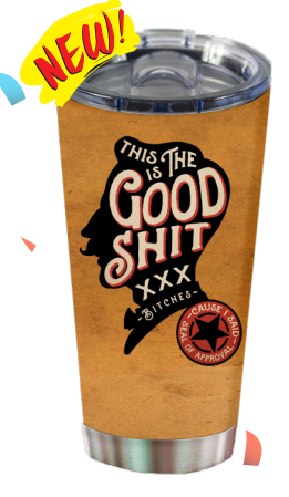
#2899 This is the The Good Shit Bitches Cause I Said - Seal of Approval