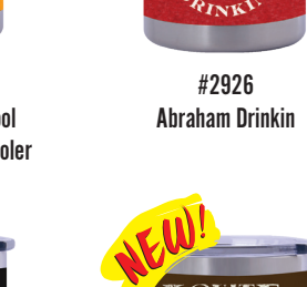
<u>โญ</u>สังเห ( )

#2938 White Lightning The Good Stuff Hand Crafted With Only Bad-Ass Aged For 30 Days Bootleggers Brand